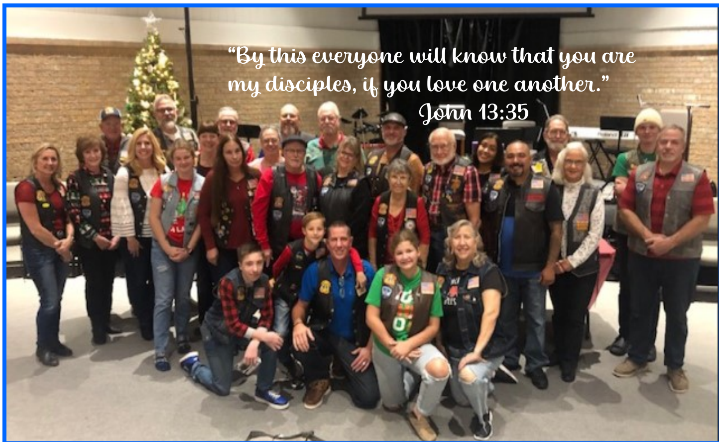
Christian Motorcyclists Association